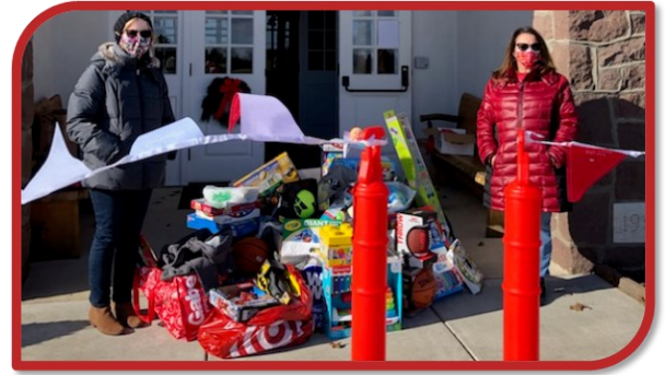
Over 150 gifts were collected for the Angel Tree program.