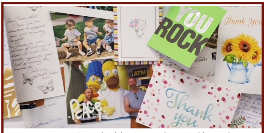
A sample of the many cards received by Food Ministry

We are so proud of the good folk and good cooks of New Hanover Church who are stepping up to the plate to send meals out to those in need. Thank you so much for that very good idea! Take good care of your good workers and be well.