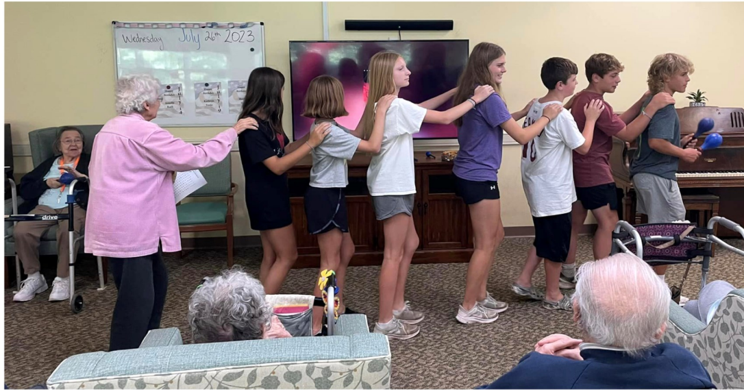
Campers bridged the generation gap having fun with some seniors.