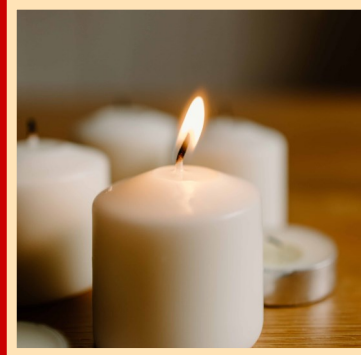
Wave of Light