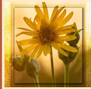
Wave of Light