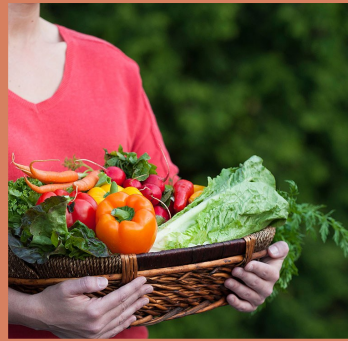
Garden of Hope